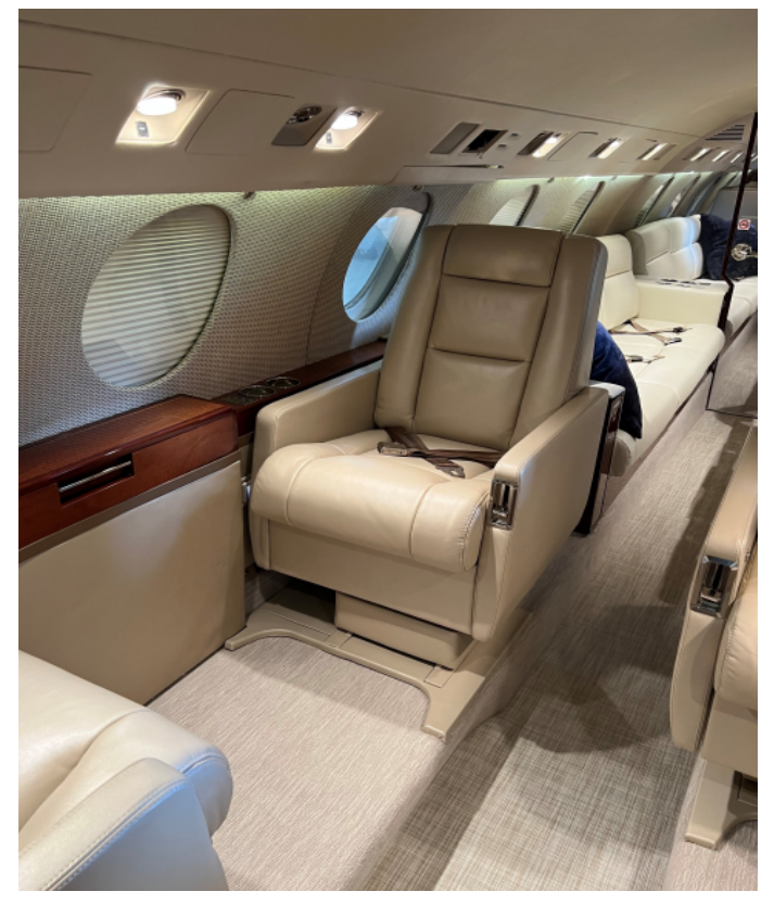
Flight Source International, Inc. has not conducted a pre-purchase inspection of this aircraft to verify mechanical condition, airworthiness or accuracy of specifications. Prospective purchasers are encouraged to conduct their own independent pre purchase inspection as Flight Source International, Inc. makes no representations as to the airworthiness of the aircraft or the accuracy of the above information. Specifications Subject To Verification Upon Inspection. Aircraft Subject To Prior Sale.