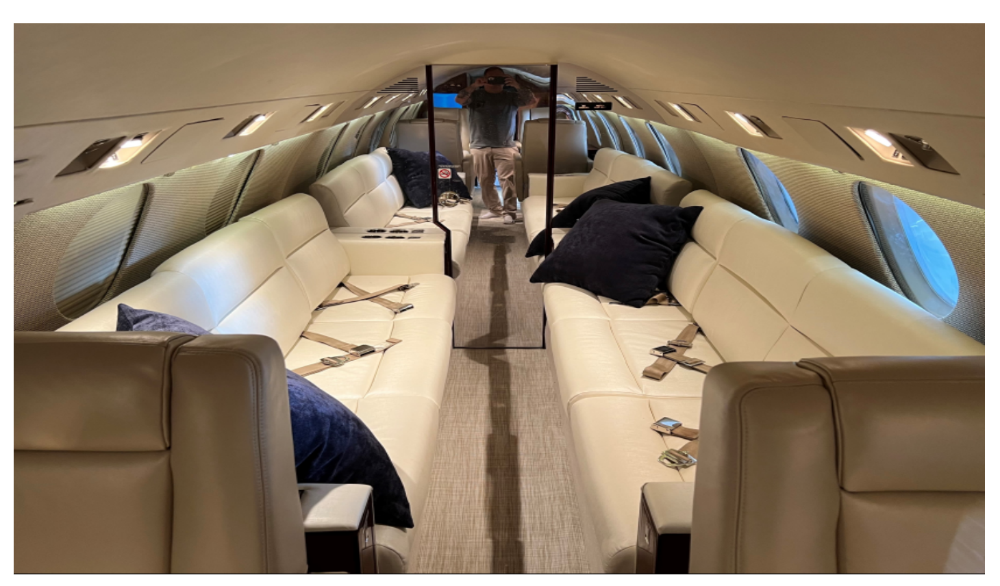
Flight Source International, Inc. has not conducted a pre-purchase inspection of this aircraft to verify mechanical condition, airworthiness or accuracy of specifications. Prospective purchasers are encouraged to conduct their own independent pre purchase inspection as Flight Source International, Inc. makes no representations as to the airworthiness of the aircraft or the accuracy of the above information. Specifications Subject To Verification Upon Inspection. Aircraft Subject To Prior Sale.